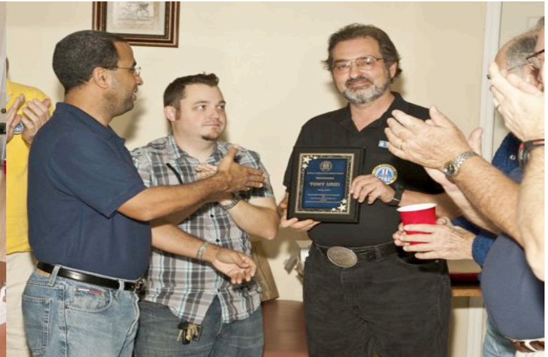
Reaching out to Mr. Outreach