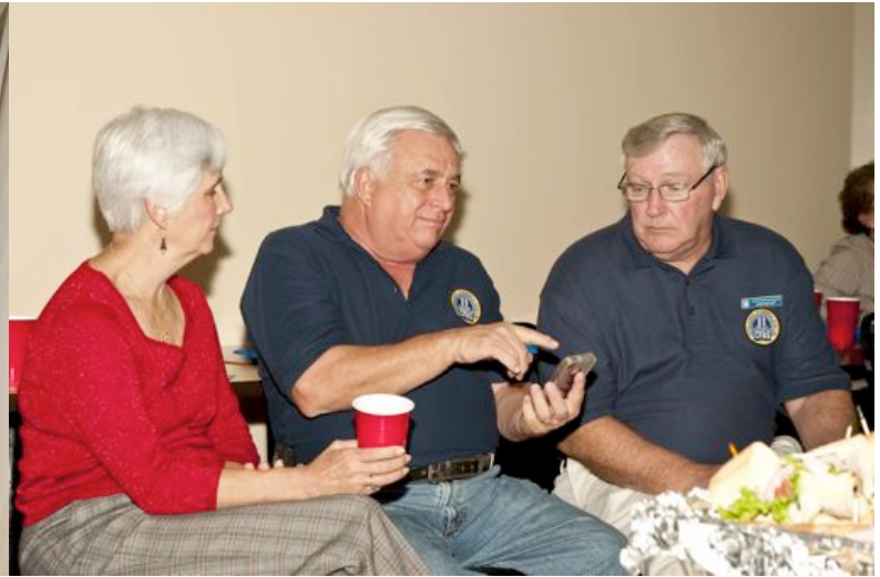
You won't believe what this APP does.