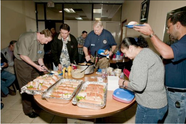
Mmmmmmm – Good!