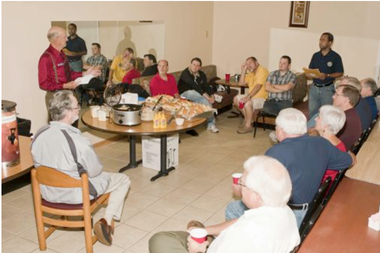
Business Session Before Treats