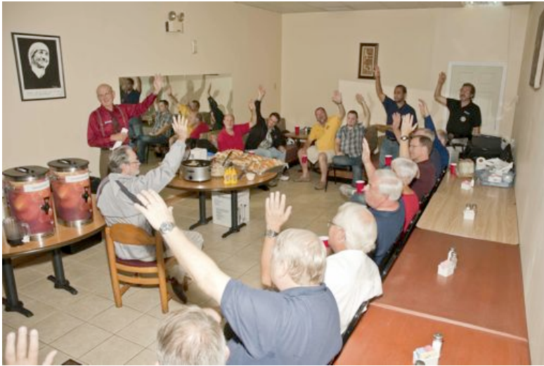
And the 2012 Budget is approved.